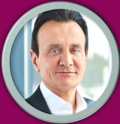
Pascal Soriot Chief Executive Officer